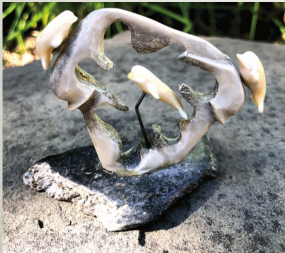
Miniature beluga whale carving made from bone and ivory.