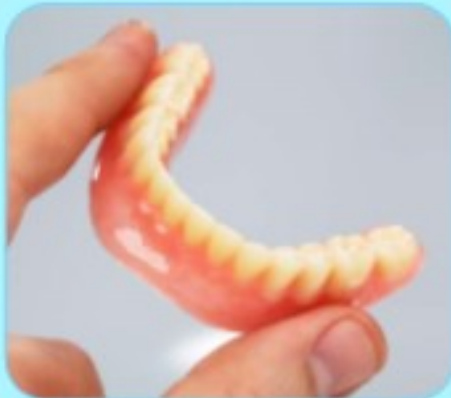
Dentures (false teeth) can be given to people who have lost their adult teeth.

Tooth decay can cause teeth to become damaged or even make them fall out. Tooth decay is caused by plaque . Plaque is a build-up of food and bacteria on the teeth, especially around the gum line. The bacteria creates acid to break down the food left on the teeth. This is what causes teeth to rot. Over time, this can cause cavities (holes) in the teeth. Eventually, these holes will get bigger until they cause the tooth to die and fall out.