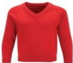
Performa 50 Pullover from £13.50 with Logo

Sensible black shoes should be worn – NOT trainers