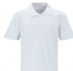
Classic Polo Shirt from £6.40 with Logo

You can buy the uniform online - search ‘Gooddies Wreningham.’