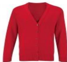
Performa 50 Cardigan from £14.00 with Logo