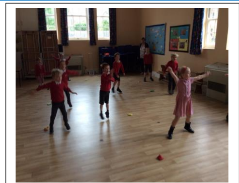
Right - Children completing a warm-up with Jo Wicks.