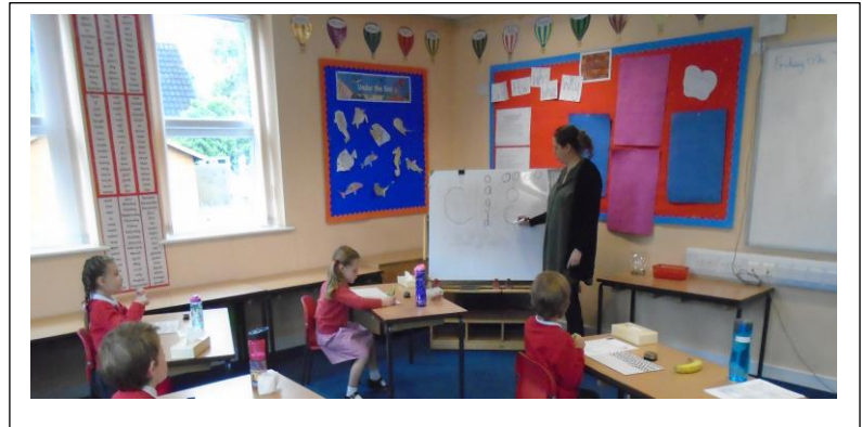
Children practising their handwriting, writing the letter 'c'