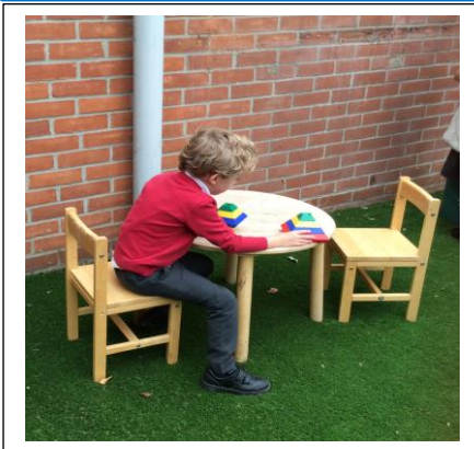
The school open its gates on Monday to more children and it's been a successful week.