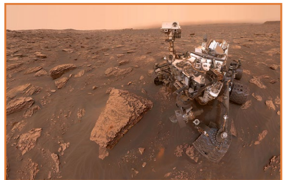
A self-portrait taken by NASA's Curiosity rover.

radiation – Energy emitted by the Sun, some of which is dangerous to humans when not absorbed by the atmosphere of a planet.