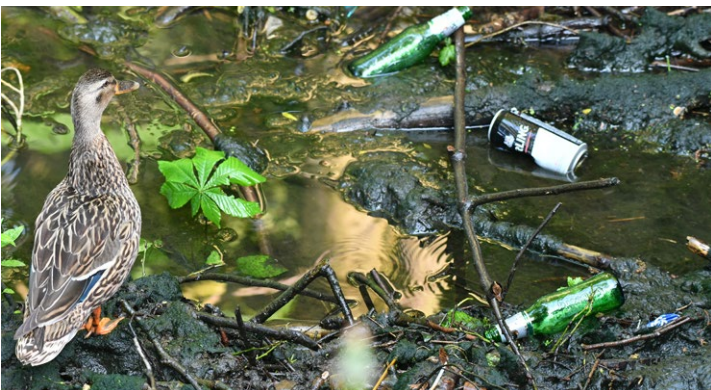
"Female Mallard By Water With Rubbish" by Martin Kessel

A huge problem with the plastic that ends up in the environment is the chemicals it releases. Over time, pieces of plastic litter will break into smaller pieces. When plastic breaks into tiny pieces, known as microplastics, it is consumed by wildlife that mistake it for food. Alarmingly, these microplastics contain toxic chemicals and heavy metals – poisonous and deadly to local wildlife. These make their way into the food chain, affecting not only the creature who ate the plastic but any animal that goes on to consume them.