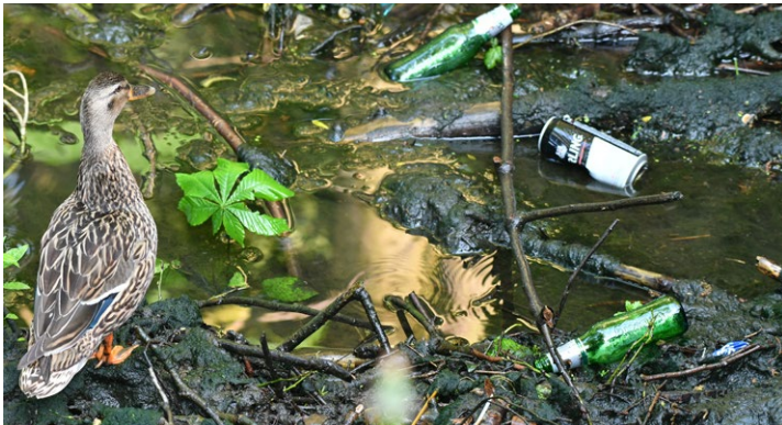
"Female Mallard By Water With Rubbish" by Martin Kessel

Scarily, these microplastics contain toxic chemicals and heavy metals – poisonous and deadly to local wildlife. These make their way into the food chain, affecting not only the animal that ate the plastic but any animal that then goes on to consume the first animal.