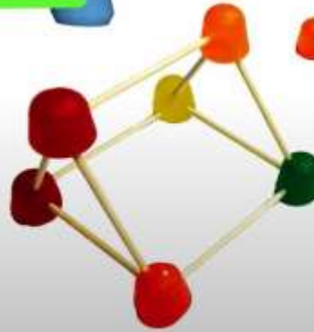
King Post Truss