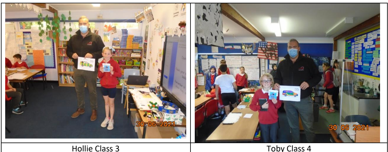
Hollie Class 3